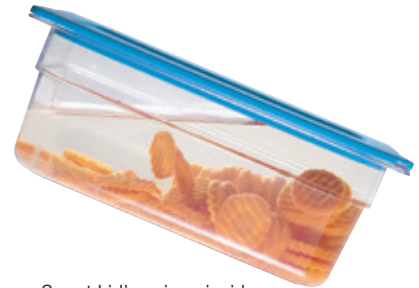
Smart Lid's unique inside seal design provides superior leak-resistance; protects against spills