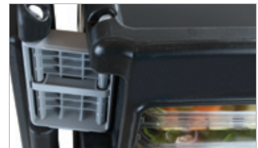
Exclusive double hinge opens 270°