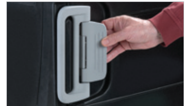
Button-hole latch design offers convenient one hand operation