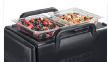
Flat top design can be used as a prep surface when space is limited