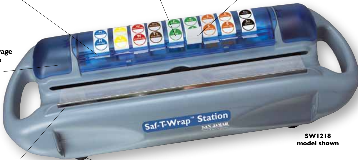
SW1218 model shown

Integrated storage compartments for pens & box cutters